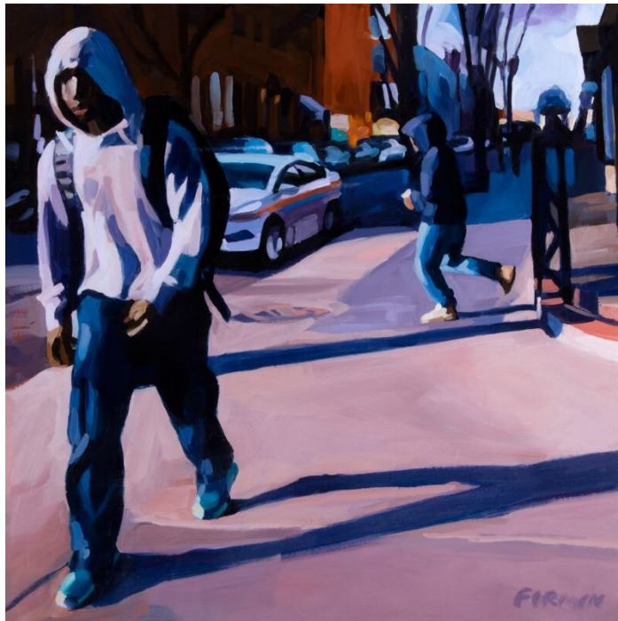
“Man in a Hoodie”, 2017 - Oil on wood panel, Framed Dimensions: 21.26 x 21.26 in. (54 x 54 cm)

I moved upstate in 2000, and painted my urban landscapes for several years, while living up here and going back to the city to get material. My career was in full throttle at this point; I had two galleries, one in Provincetown (which I still have) and one in Santa Fe. I was producing around twenty-five paintings a year, not including the monoprints, and selling almost everything I painted. Gradually though, since I wasn't painting what I was seeing, the work got a little stale. So in 2007 I started going to figure drawing classes and painting nudes. My galleries didn't want this new work, so I sort of melded those two things together and started painting the figure in the urban landscape, so the figure could take up the whole painting! I love painting the light on the figure. I love painting light — period.