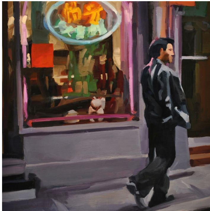
"Chinatown Windows I," 2013 - Oil on wood panel, Framed Dimensions: 17.32 x 17.32in. (44 x 44cm)

Your urban landscapes follow up on the tradition of such painters as George Bellows and Edward Hopper. What do you think initially attracted you to their style and to their expressive explorations of human solitude?