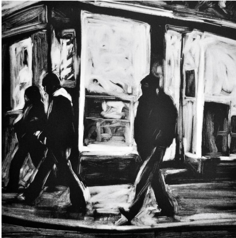
"Barbershop, Chinatown", 2014 - Lithograph printed by Corridor Press, Otego, NY, Framed Dimensions: 27 x 27 in. (68.6 x 68.6 cm)

Your work that is currently being shown as a part of C24 Gallery's group show Street Life includes not only your colorful oil paintings but also black and white lithographs. What appeals to you about contrasting the oil paintings with your monochrome lithographs? In what ways do the two approaches complement and also contrast each other in terms of your thematic approach to depicting urban life?