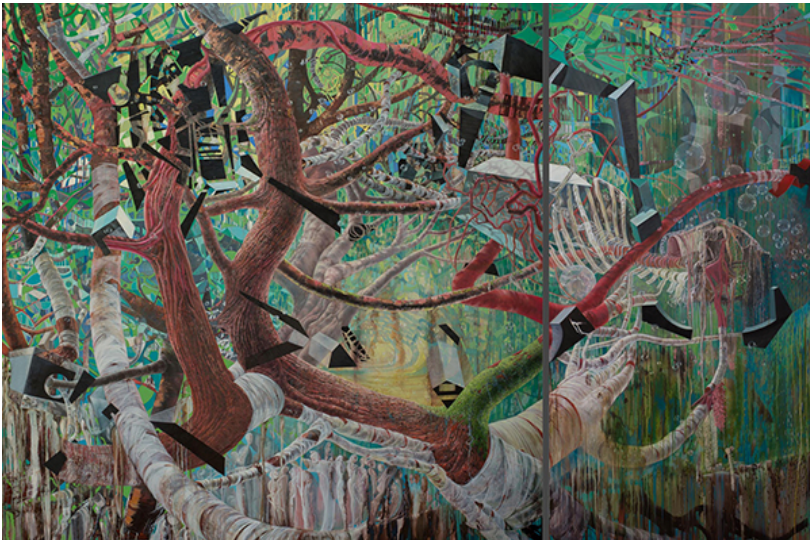
Fatemeh Burnes, Wonderland (2014–15).