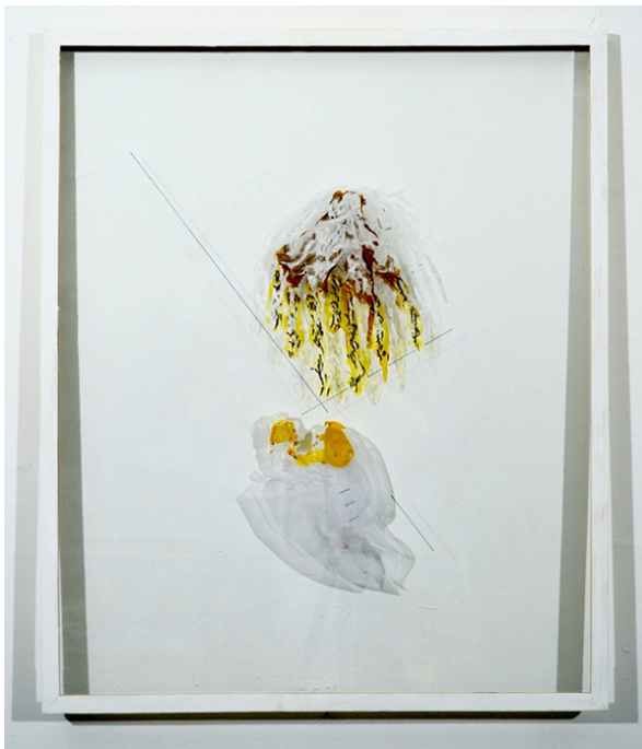
Chris de Boschnek, Untitled No. 12 (2015).