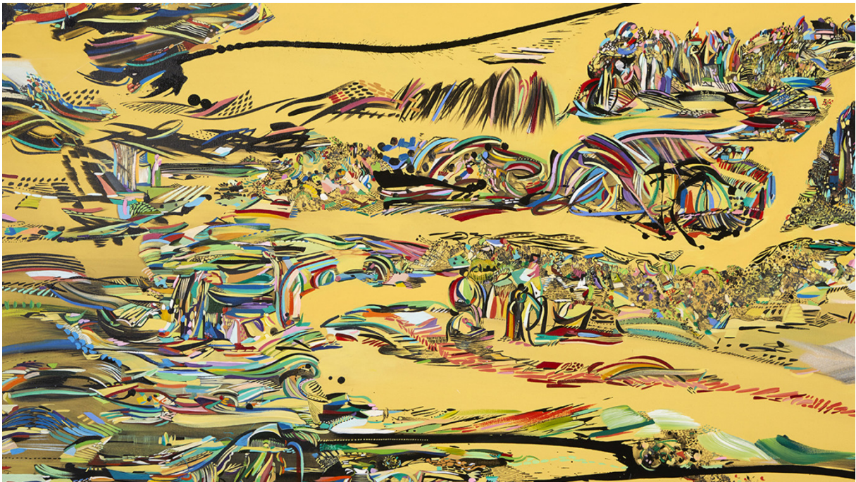
Regina Scully, Mindscape 2 , 2017, Acrylic on canvas, 39 x 64in.

C24 Gallery proudly presents Mindscape , a solo exhibition of new paintings and works on paper by New Orleans based artist Regina Scully.