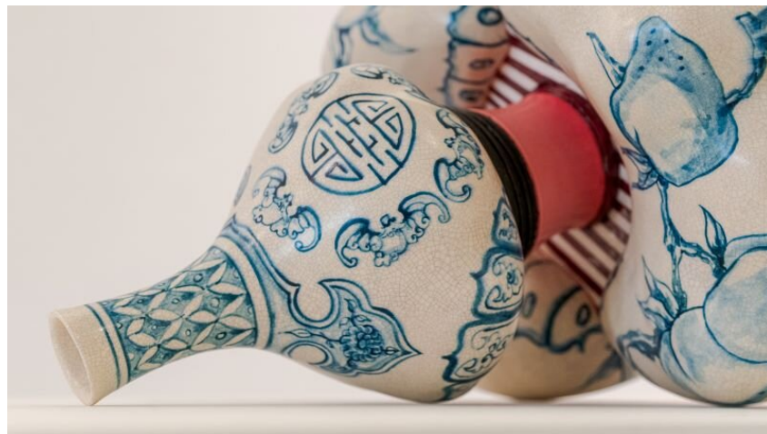
"Manga Ormolu 4.0r" (detail)

You work primarily with clay. What drew you to this medium, and what do you consider to be some of the key challenges and advantages of working with it?