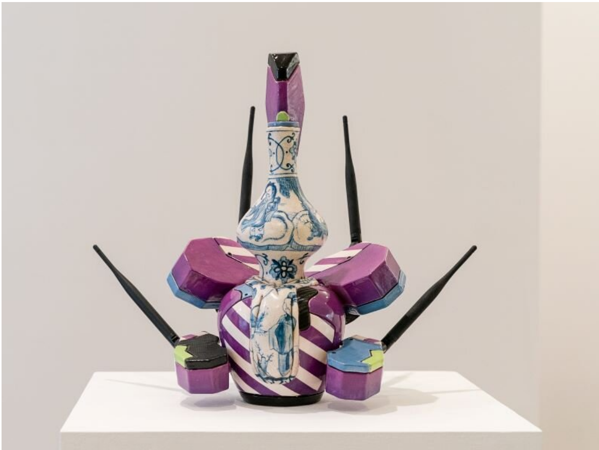
"Manga Ormolu 4.0u", 2015, Ceramic and mixed media - 15 x 10 x 11in. (38.1 x 25.4 x 27.9cm)

The "Earthen Delights" exhibit features ceramic works that update and subvert this traditional craft. What appeals to you about the way you have combined Chinese Ming dynasty vessels with robotic prosthetics inspired by anime and manga, and how do you think this mashup fits into the overall theme of the exhibit?