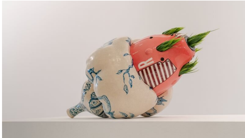
"Manga Ormolu 4.0r", 2013, Ceramic and mixed media - 16 x 20 x 13in. (40.6 x 50.8 x 33cm)