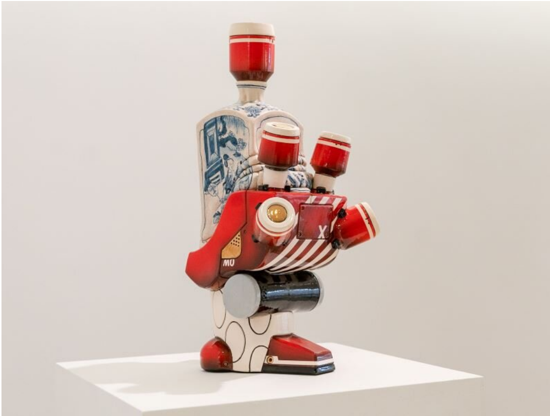
"Manga Ormolu 5.0x", 2019, Ceramic - 22 x 11.5 x 10in. (55.9 x 29.2 x 25.4cm)

At C24 Gallery's group show "Earthen Delights," you currently have works on display from your series "Manga Ormolu." The gallery describes these pieces as "a futuristic update of the 18th-century French practice of gilded ormolu." Could you explain what 18th-century French gilded ormolu was, and why is it a foundational inspiration for you with this series?